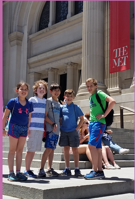
A beautiful day for learning about art!