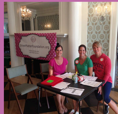
Some of our wonderful Blood Drive volunteers!

The Silver Platter Foundation provides goods and services to families affected by adult blood cancer who have children living at home. We are here to help with food, transportation, housekeeping, school supplies, clothing, or any other everyday need. Whether you are a family seeking assistance or a donor looking to help, we want to hear from you. Visit our website at www.silverplatterfoundation.org .