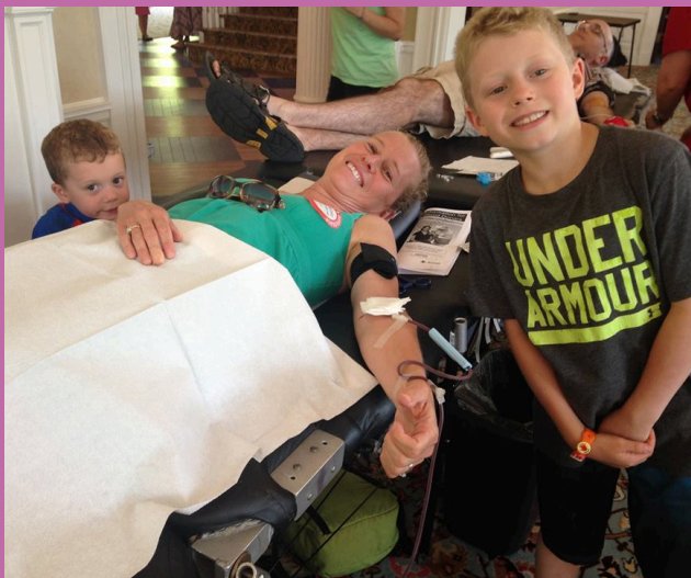
A mom demonstrating what philanthropy is all about!